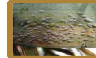
Nymphs and nymph exuviae on the surface of a frond and the symptoms of drought are beginning to show.