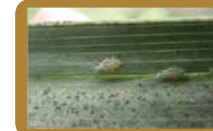
Nymphs with bristles on the lower abdomen & protrusions on both sides of the abdomen.